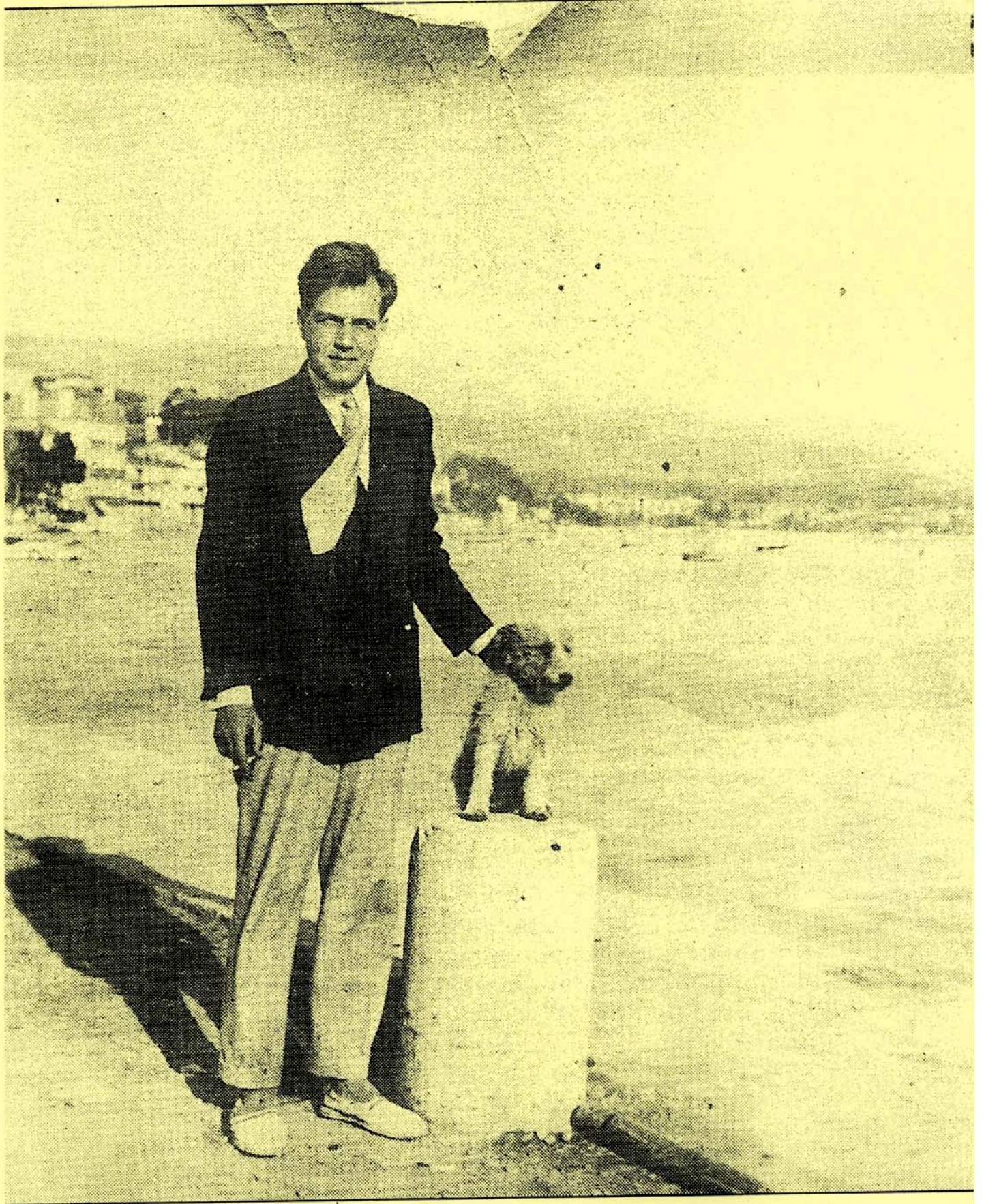
Emmanuel Bove à Bandol vers 1928